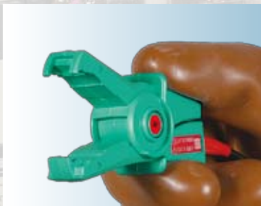
For cables from \phi 2.4 to 30mm

Safe Testing without direct contact with live wires!!