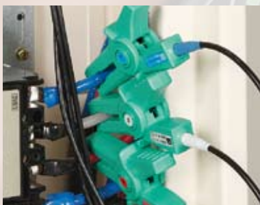
Can clip insulated cables